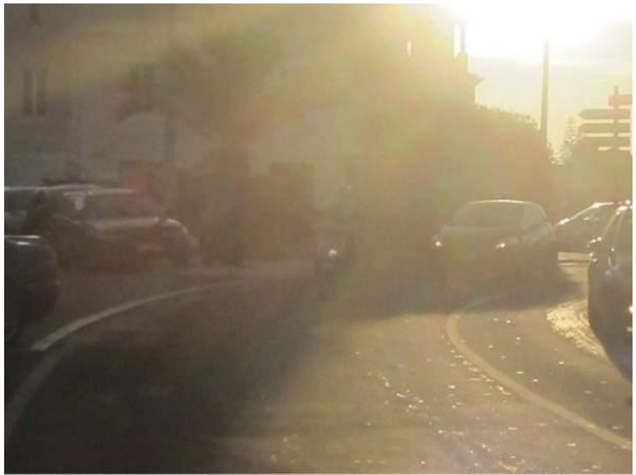
When objects fall into the shadow of 'up-sun' objects they are especially hard to see – did you see the moped coming towards you in the preceding picture, even with its light on?

Keep your windscreen clean! Seeing other vehicles can be difficult enough, without tipping the odds against you by having to look through a dirty windscreen. You <u>never</u> see a fighter jet with a dirty canopy.