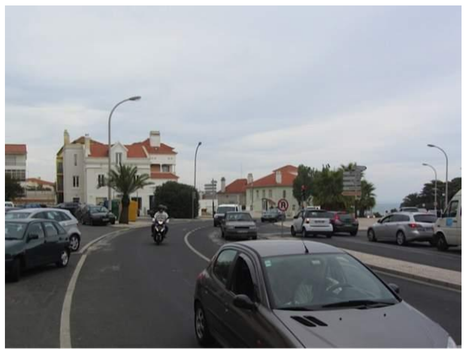
This image is taken on an overcast day – what photographers might call a 'low-contrast day'. However, the vehicles in this scene can all be seen easily, and the light coloured top of the scooter rider provides reasonable contrast against the generally darker background. Note that the headlight is especially effective.