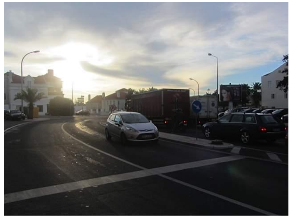
In this scene the sun is partly covered by cloud but contrast is still poor and high visibility clothing, in bright colours that are not generally encountered in the background scene, will increase contrast and be detected more easily.