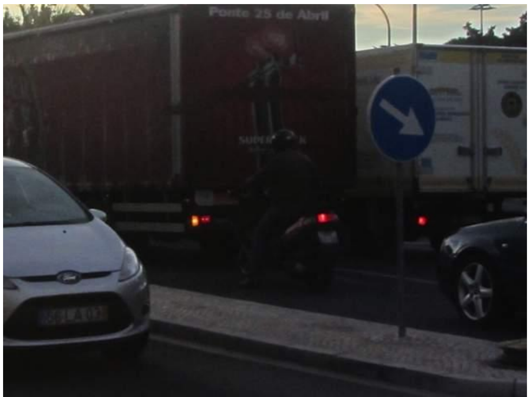
Did you see the moped rider in the preceding picture? Give yourself a chance!

The relatively slower speed of bicycles means that they will be closer to a point of collision if a vehicle begins to pull into their path. Turn this to advantage - when passing junctions, look at the head of the driver that is approaching or has stopped. The head of the driver will naturally stop and centre upon you if you have been seen. If the driver's head sweeps through you without pausing, then the chances are that you are in a saccade - you must assume that you have not been seen and expect the driver to pull out!