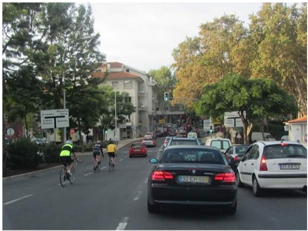
Give yourself a chance! Compare the visibility of the cyclists wearing bright coloured tops, as compared to the cyclist in the centre.